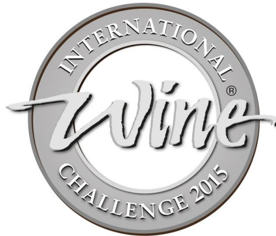
Dated Master Logo